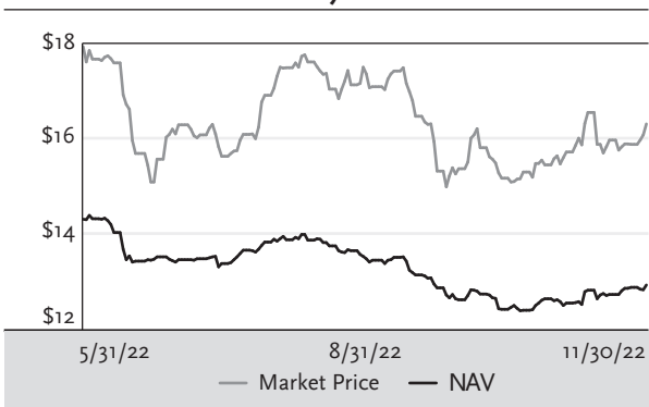
Market Price & NAV History